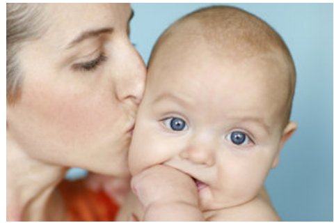
Taken at ISO 400, f/2.0, 1/320 sec. With a Canon EF 85mm f/1.8 lens. (Click on photo to zoom)