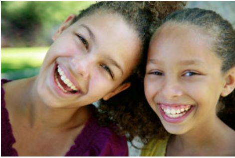
Taken at ISO 200, f/4.0, 1/125 sec. With a Canon EF 24-105mm f/4.0L IS lens. (Click on photo to zoom)